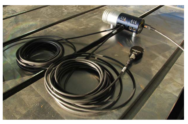
Sensors connected to the XC-80 compensation unit measure temperature and air pressure, allowing tests in any conditions

Printed calibration certificates In one simple step, the laser interferometer software will enable calibration certificates and measurement reports with graphs and tables to be printed out, showing the state of the machines before and after compensation or repair. When regularly performing measurements and tests, the comprehensive documentation can cover the whole history of the machine. This in turn means that the client can meet demands for complete and transparent quality assurance.