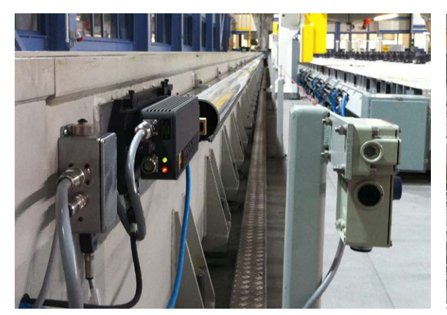
HS10 laser encoder fires its beam down the air purged duct

With a rack and pinion drive on each side of its gantry, the CMC uses split X axis feedback with a laser on each side, working as a master and slave for positioning. The lasers are located under the way cover bellows near the drivetrain, in a duct purged with clean, dry air, ensuring stable measurements and protection from airborne debris which might "break" the laser heams