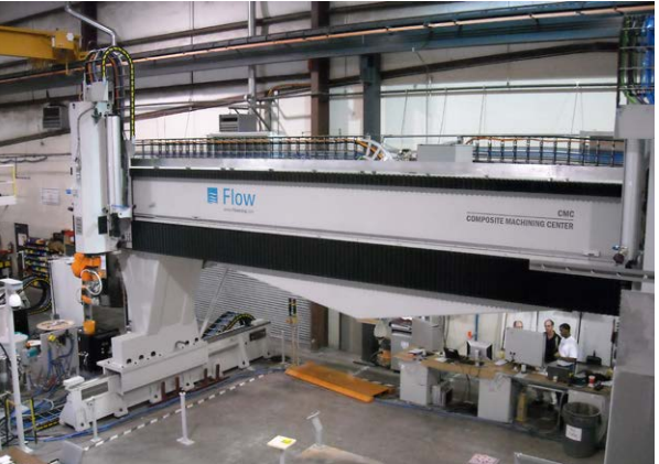
Wing cover CMC at the Flow workshop, Indiana

Unlike a tape or glass scale, the laser encoder system has no short term errors which can "stack up" on long axes, and its 1 m/sec measuring speed accommodates today's fast-moving machine tools. The HS20 is sealed to IP43 and hard anodized to provide all round protection in harsh machining environments. "Our X axis repeatability spec for a 40 m gantry is 0.0381 mm (0.0015"), essentially equal to the laser interferometer used to calibrate the machine," said Fuchs. "The laser also provides twice the resolution of a tape scale, though a machine of this size and type is unable to make use of it."