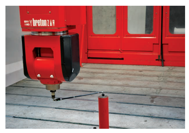
Breton uses the Renishaw QC20-W ballbar to check machine positioning performance

Prior to adopting the latest technology from Renishaw, Breton calibrated its machine tools before shipment using the ML10 laser for linear compensation of CNC axes, and a laser system from another supplier to capture straightness data on machine guides. However, Breton experienced several problems on axes over four meters, where metrology data was inconsistent.