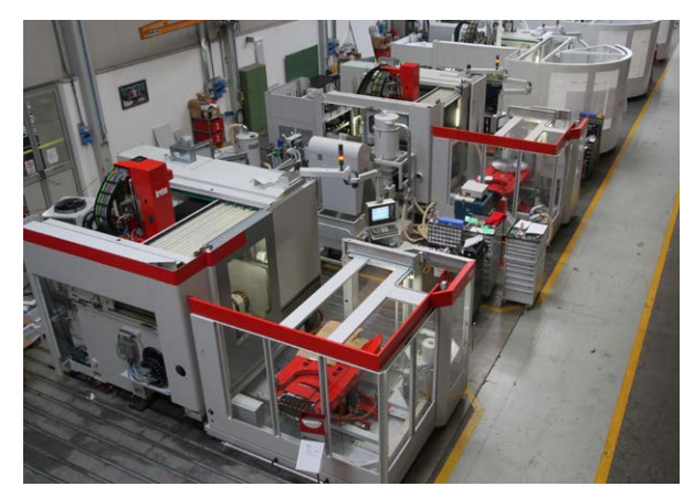
Breton's machine shop

Once staff in the maintenance division, who already used a ballbar system for their periodic checks, showed others how easy to use and accurate the system was, it became a standard tool in every part of the company needing calibration controls.